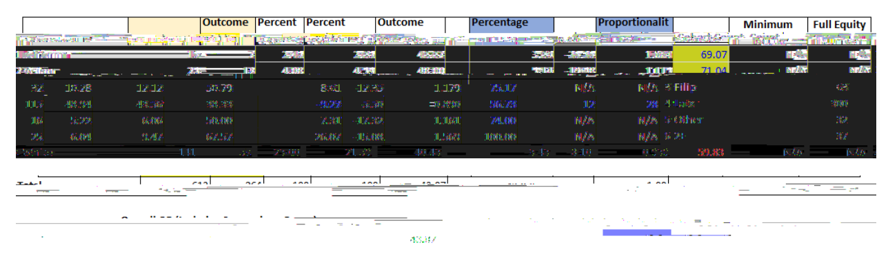
Reference Group OR (Highest OR) 67.57